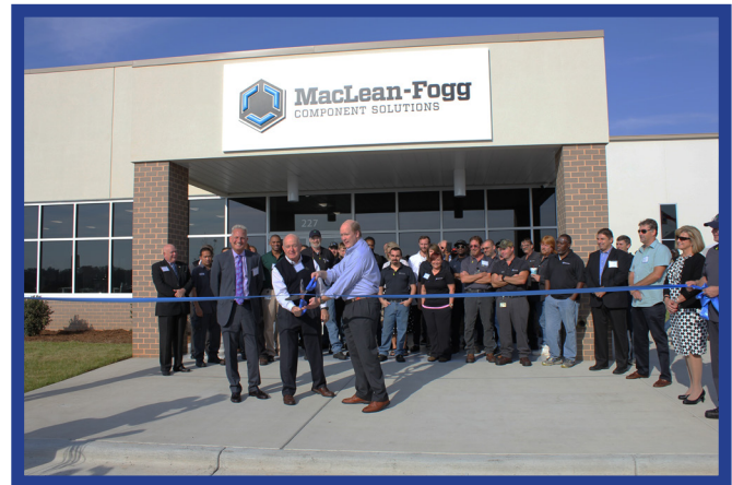
MBPE tenant ribbon cutting celebration!

Note: MBPE is owned by the South Iredell Community Development Corporation (SICDC). The SICDC is a public/private partnership charged with developing industrial land for private sector job and investment growth. The SICDC provides flexibility and expedited capabilities in the land transaction and building processes.