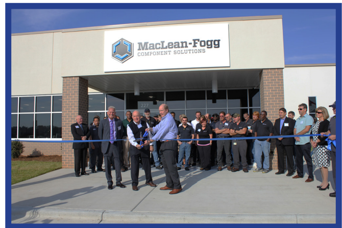
MBPE tenant ribbon cutting celebration!

Note: MBPE is owned by the South Iredell Community Development Corporation (SICDC). The SICDC is a public/private partnership charged with developing industrial land for private sector job and investment growth. The SICDC provides flexibility and expedited capabilities in the land transaction and building processes.